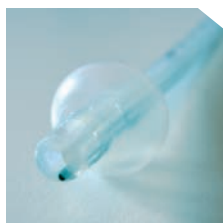
Soft silicone balloon to conform to vessel wall