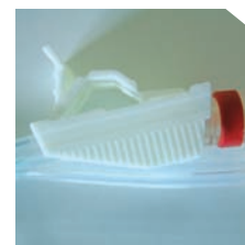
Simplified Lock System