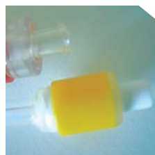
Balloon inflation port